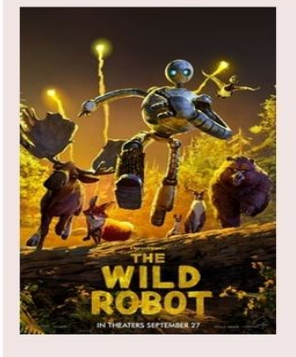
WILD ROBOT Showtime: Nov 1 and 2: 7:30 pm Nov 3: 2 pm