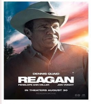
REAGAN Showtime: Saturday Nov 30: 7:30 pm Dec 1: 2 pm

VENOM: THE LAST DANCE Showtime: Nov 22 and 23: 7:30 pm Nov 24: 2 pm